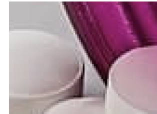
Don't: Grainy / unclear