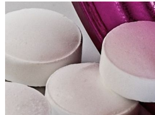
Do: Clear and crisp